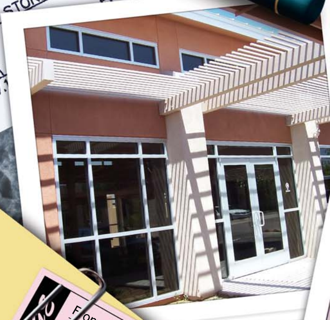
Carriage Lane Office Buildings