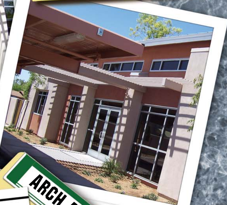
Carriage Lane Office Buildings